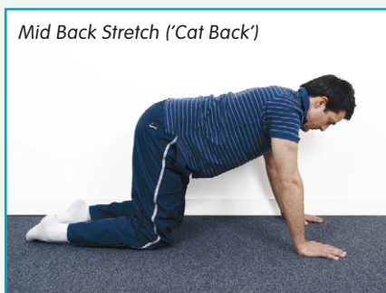
Mid Back Stretch ('Cat Back')