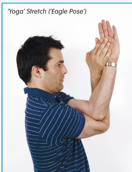
'Yoga' Stretch ('Eagle Pose')